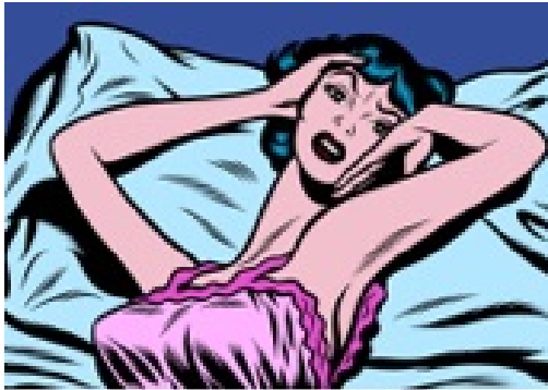
CREATED IN DARKNESS BY TROUBLED AMERICANS