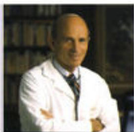
KENNETH H. COOPER, M.D., M.P.H.

Download or Read Online Controlling Cholesterol Kenneth H. Cooper Free eBook PDF/ePub/Mobi/Mp3/Txt , This first and only authoritative mass market bestseller on cholesterol contains the most up-to-date, medically sound information on diet, nutrition, exercise and lifestyle--and their impact on coronary problems. Includes the latest information on determining a coronary risk profile, an all-new exercise program, low-cholesterol recipes and more.